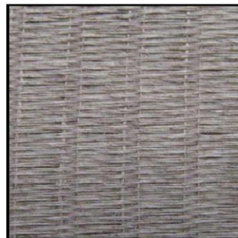
Unidirectional (UD) fabric